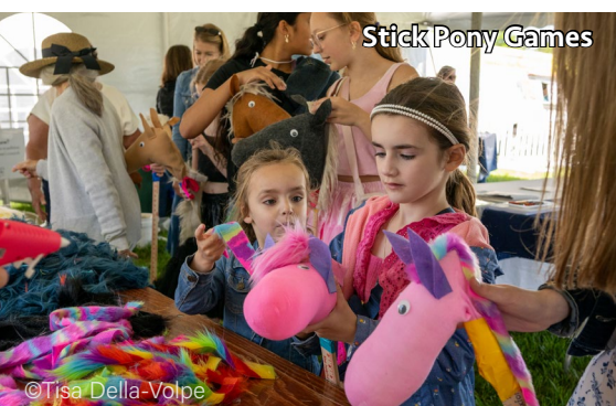
Stick Pony Games